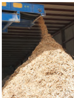
Recovers nearly 98 % of incoming wood with a 99 % purity.