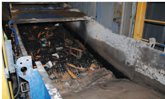
Heavy fraction sinks while wood floats and gets clean.

The wet sorting system includes sink float tanks for high wood recovery rates.