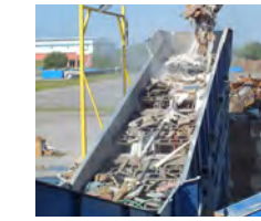
Vibrating Finger Screen