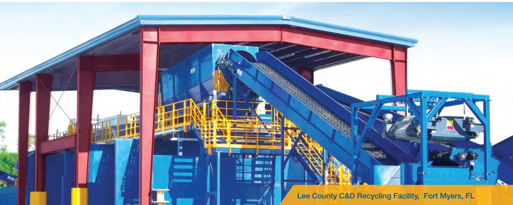
Lee County C&D Recycling Facility, Fort Myers, FL

Service and support are paramount to overall operating success. In fact, having a single source just a phone call away is critical to ensure maximum plant uptime. Once your Machinex equipment is installed, our service & support team will be ready to assist you. They are 100% dedicated to the optimization of operations and are there to serve you!