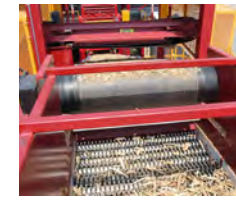
MACH C&D Screen

Different types of screening separators to sort materials by sizes.